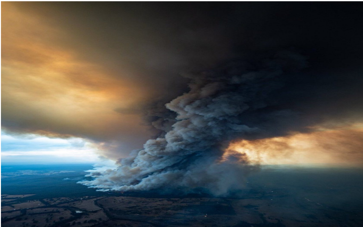
Smoke rises from a fire in East Gippsland, Victoria, Australia